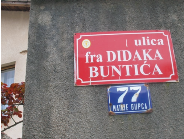
Fig. 1.2 Ulica fra Didaka Buntića is a new street name, named after a Catholic priest born in 1871. The old street name (in the sign below) was dedicated to Matija Gubec, a Croat farmer who was a leader of a farmers' uprising in the sixteenth century. During WWII his name was associated with the socialist Yugoslav Partisans and a Croat and a Slovene Partisan brigade were named after Gubec.

the case of the renamed streets in Croat-dominated West Mostar, people have not (yet) switched to using the new names, but rather refer to the streets by their old names. I also noticed a discrepancy between the prescribed meaning (by the ruling elites) and the people's interpretations and 'reading' of war memorials; the latter often significantly differed from the former (see Kansteiner 2002).