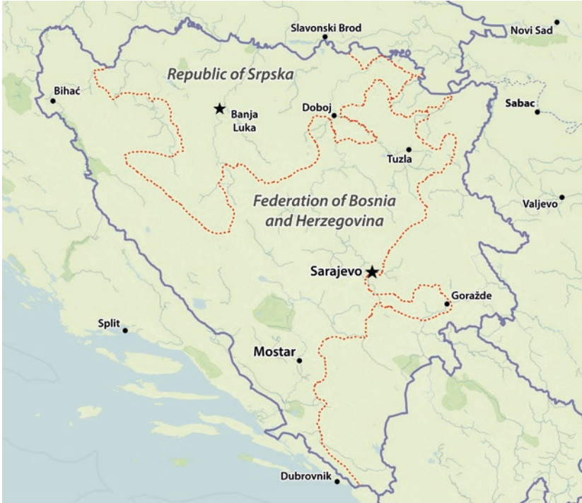
Map 1.2 Map of present-day Bosnia and Herzegovina showing the Serb Republic ( Republika Srpska ) and the Bosniak-dominated Bosniak–Croat Federation. Map by Alexei Matveev. Map data © OpenStreetMap contributors

This book explores how Mostar’s different generations place themselves vis-à-vis competing authoritative narratives of the local past. It analyses how experiences and exposure to different political-historical periods/events and memory politics affect people’s historical understanding. I do not suggest that individuals are unaffected by existing canonical national historiographies when orienting themselves anew in society and that they do not take part in reaffirming them. Instead, I argue that we should not assume individuals naïvely take on new dominant public discourses and simply overwrite their previous experiences. Although political changes may come about abruptly and radically, it would be inaccurate to assume that a society fully adapts to all of these changes, and even more inaccurate to imagine that such societal changes take place at the same speed at which political elites change.