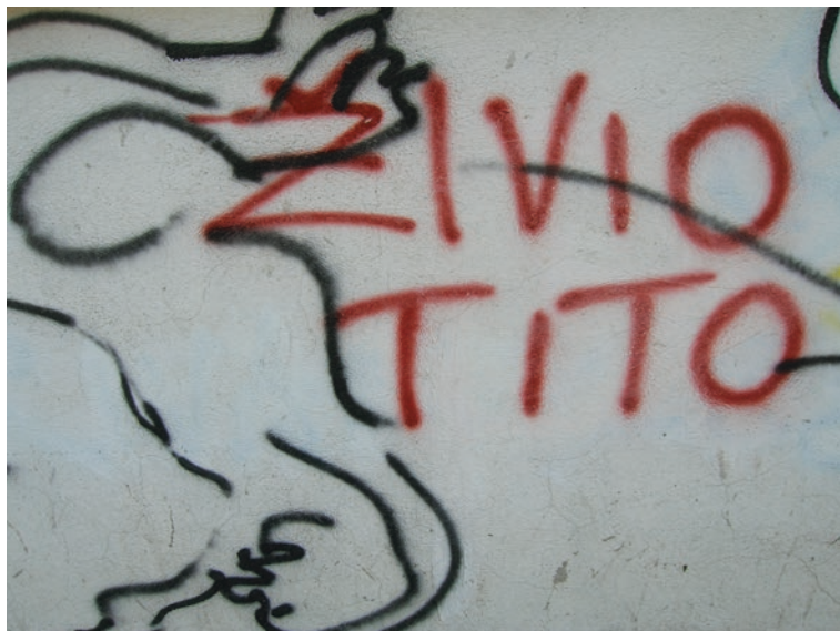
Fig. 5.1 Graffiti stating: 'Živio Tito' ('Long live Tito').

way soon after WWII. Young people at the time responded to the call to volunteer in several big national reconstruction projects. Aida told me: