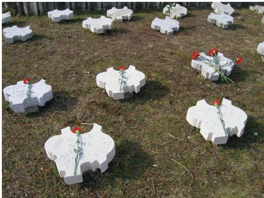
Fig. 4.4 Partisan commemoration ceremony, 2008.