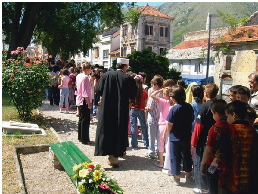
Fig. 3.3 The imam with pupils at Šehitluci (martyrs' cemetery), 2006.

stone reinforces what the imam has just told them. Not all pupils seem to notice it, but some do and point in the direction of the stone with their carnations. The caravan moves down to the riverbed to a stage from which loudspeakers burst out popular folk music. The children's excitement increases from being so close to the water. Some of them have little BiH flags in their hands. Listening to the music being played, I notice that it is a song about Tuđman, accused enemy of beautiful BiH. After two men dive from the bridge into the river (an old tradition associated first and foremost with Mostar's pre-war identity and which today is almost exclusively practised by Bosniaks), the ceremony reaches its peak, the announced history lesson. A man in his early 50s takes the stage and address the audience: