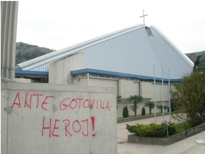
Fig. 2.1 Graffiti next to the Catholic cathedral stating: ‘ Ante Gotovina heroj ’ (‘Ante Gotovina is a hero’). This graffiti appeared at several places in West Mostar in December 2005 when Gotovina, a Croat general, was arrested by the International Criminal Tribunal for the Former Yugoslavia (ICTY).

Unlike Bosniak and Croat politicians who encouraged co-nationals to return to Mostar in order to maintain or attain majority status, Serb politicians who claimed that Mostar was—like the Federation in general—a hostile place for Serbs discouraged Serbs from returning. Moreover, they argued that children would not be able to keep their Serb identity, for example, because of the Bosniak–Croat-dominated education system in Mostar. Even if returnees today no longer face security issues, and military or police patrols in returnee areas are no longer necessary, they may still face discrimination, for example, through insulting statements in the media or from ignorant teachers in school. They may also feel unwelcome when confronted with insulting graffiti (Fig. 2.1) or, in the case of West Mostar, by the renamed streets and public places (Palmerberger 2013).