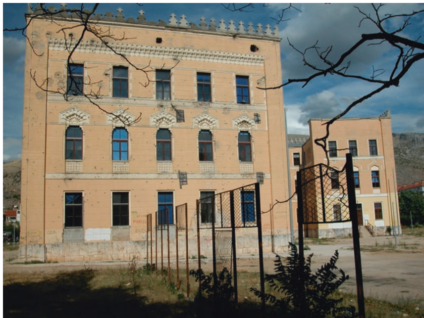
Fig. 3.1 Stara gimnazija , the Old Grammar School in 2008.

taught in one's language: 'While the right to learn one's own language is guaranteed, there is no guarantee in any convention or in the BiH and Entity constitutions that peoples have the right to be taught in a particular language' (Ashton 2007: 9). Yet we should be aware that the position of the international community towards the language issue is itself ambivalent. For example, on the one hand the OSCE does not support the idea that children should be taught in their respective languages, while on the other hand all official OSCE documents (and its website) are written in all three official languages: Bosnian, Croatian and Serbian. This OSCE practice strongly signals the need for linguistic separatism.