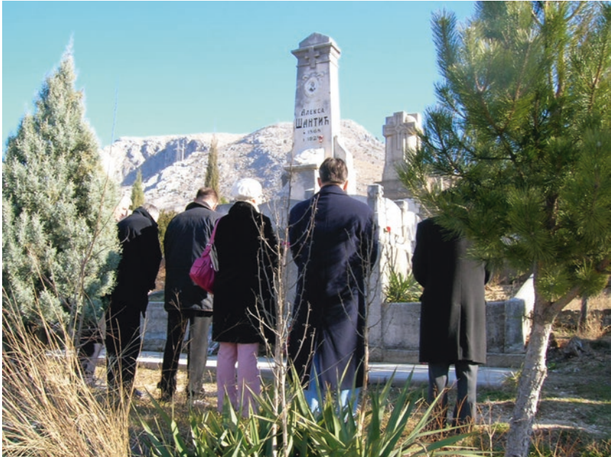
Fig. 4.2 At the anniversary commemoration of Mostar's poet Aleksa Šantić, 2006.

The ceremony in question took place on the 82nd anniversary of the writer's death. But before commemorating Šantić, another local poet, Osman Đikić, was remembered at his honorary grave, which is located close to the Old Town in East Mostar. Šantić's grave, which was visited next, is located at the Orthodox graveyard on the hills in East Mostar, close to Mostar's Orthodox cathedral which was destroyed during the war (Fig. 4.2).