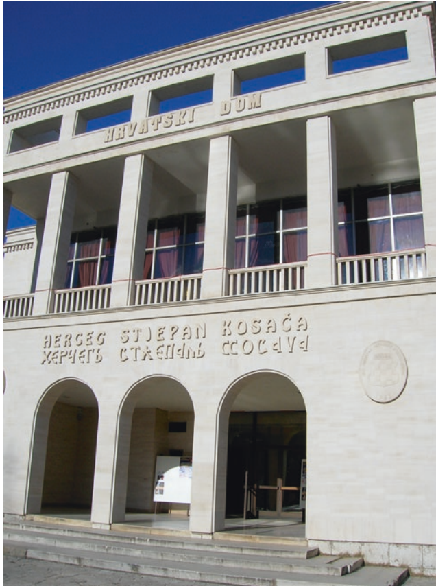
Fig. 1.1 Hrvatski Dom at Rondo .

street names tell us much about the historical consciousness of the people who encounter them every day (Palmerberg 2017). Instead, they first and foremost express the voices of those who claim to speak for the nation.