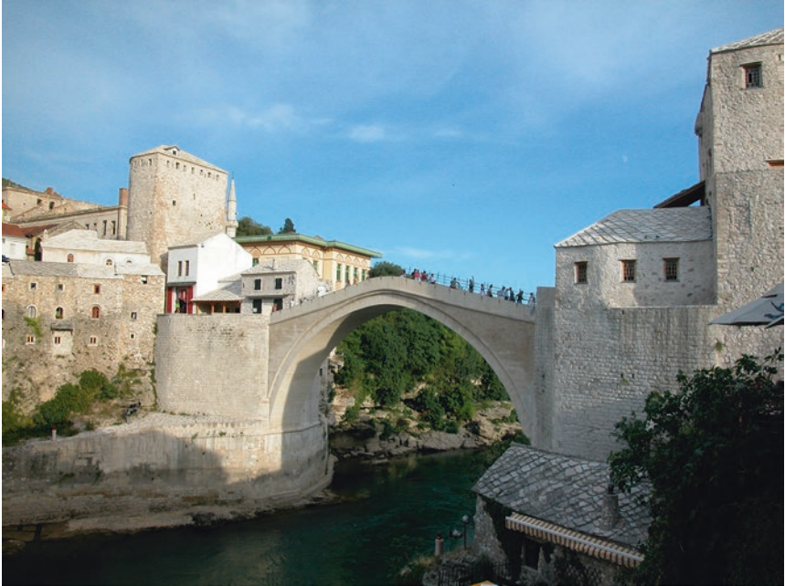
Fig. 2.2 Rebuilt Stari most (Old Bridge).

Bosniaks and Croats differed on the importance of the reopening of the Old Bridge. While most of my Bosniak informants, who were in Mostar at the time of the celebration, joined the event, most of the Croats did not. Since the Croat army, the HVO, is considered by Bosniaks, as well as by the international community, to be responsible for the final destruction of the bridge (after numerous shells fired by the Croat and Serb army had damaged it), Croats often take a defensive position when the subject of the Stari most comes up. Although I do not wish to question the reconstruction of the bridge, it is still not clear to what extent it has had an impact on the reunification of Mostar. Moreover, although often unmentioned, the Old Bridge does not connect the Bosniak and Croat parts of the city (which are divided by the Bulevar west of the bridge). 21