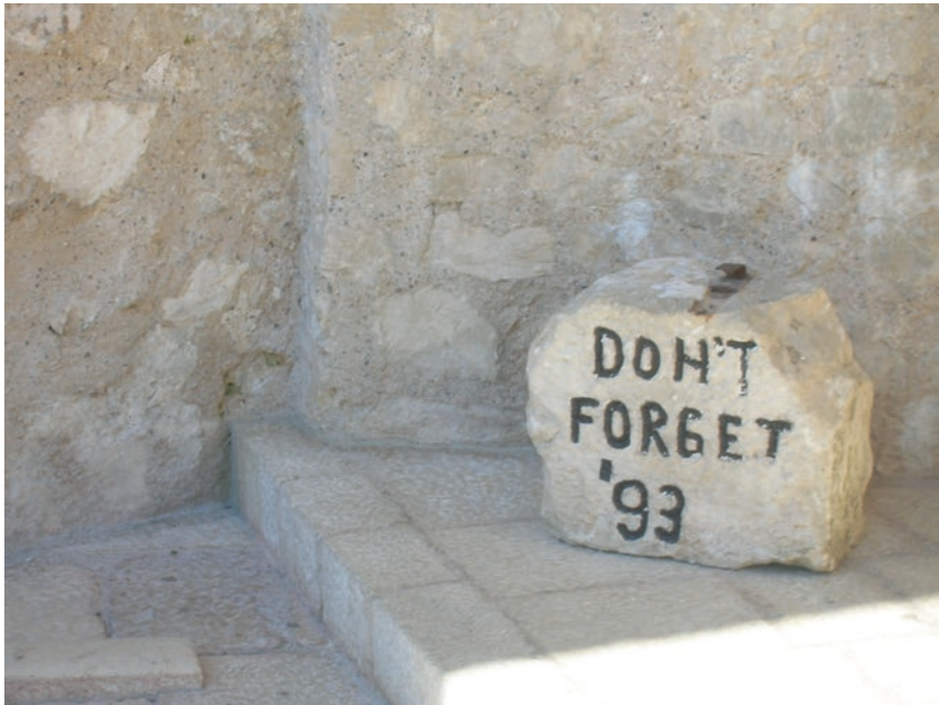
Fig. 3.2 A memorial stone at the Old Bridge.

After crossing the bridge, the pupils pass the stone-carved sign, 'DON'T FORGET '93' (written in English, Fig. 3.2). The memorial