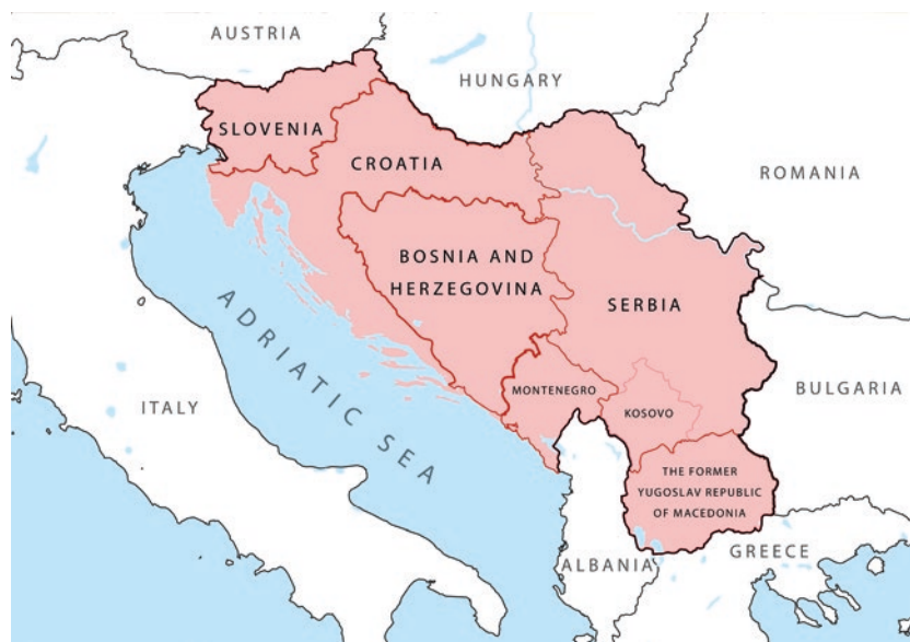
Map 1.1 Map showing the borders of former Yugoslavia, the Federal Republic of Yugoslavia. Map by Alexei Matveev. Map data © OpenStreetMap contributors

war that divided the once multinational city into a Bosniak-dominated east side and a Croat-dominated west side. Accordingly, experiences of different (often opposing) nationality and memory politics, as well as of different forms of coexistence vary greatly along generational lines. What makes the Mostar case so special is that there has been very limited interaction between Bosniaks and Croats since the 1992–1995 war, and generational commonalities still prevail in the way Mostarians 6 position themselves vis-à-vis the fractures and turning points of local history. By conducting long-term fieldwork on both sides—in Bosniak-dominated East Mostar as well as in Croat-dominated West Mostar—and by concentrating on the ways in which individuals give meaning to their personal and their community's past, I reveal generational commonalities that transcend the national border, always so dominant in present-day Mostar.